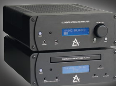
Leema Elements p.26