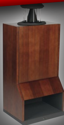
German Physiks Unicorn MkII p.20