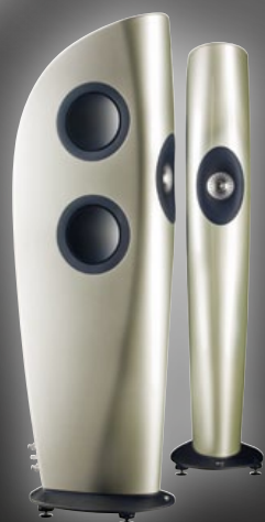
KEF Blade p.16