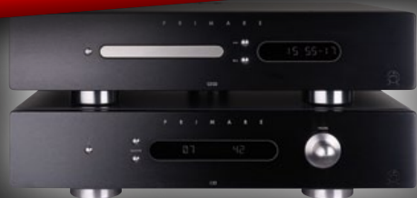
Primare I22 & CD22 p.12